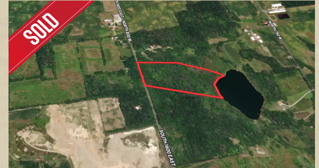
WABASH COUNTY, IN