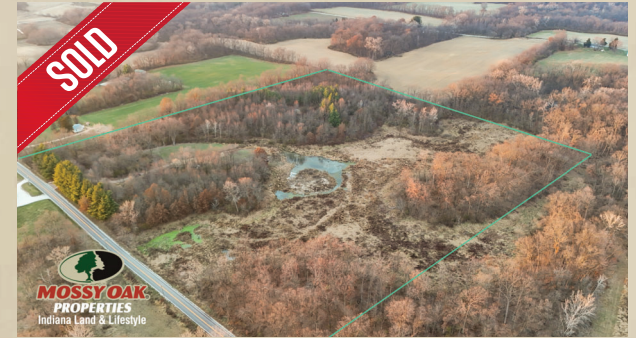
FULTON COUNTY, IN