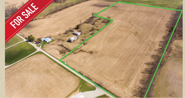
MIAMI COUNTY, IN