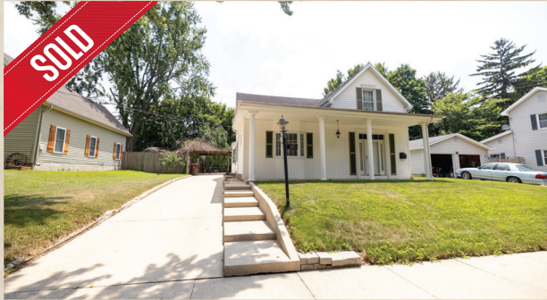
WABASH COUNTY, IN