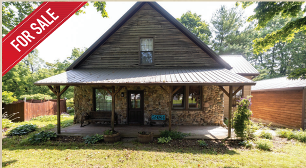
MIAMI COUNTY, IN