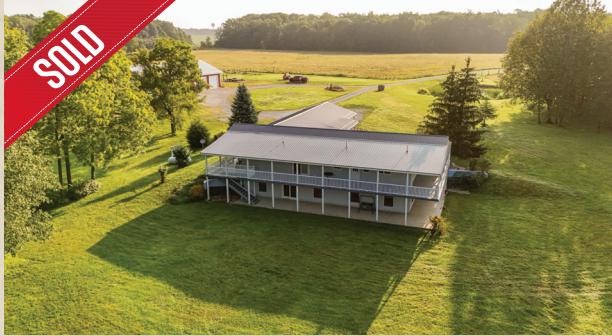
MIAMI COUNTY, IN