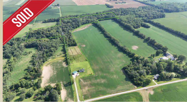
CASS COUNTY, IN