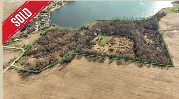
FULTON COUNTY, IN