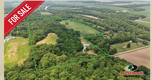
CASS COUNTY, IN