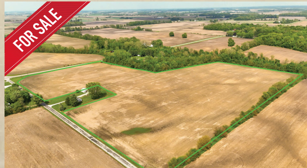
CASS COUNTY, IN