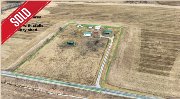
MIAMI COUNTY, IN