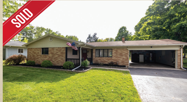
FULTON COUNTY, IN